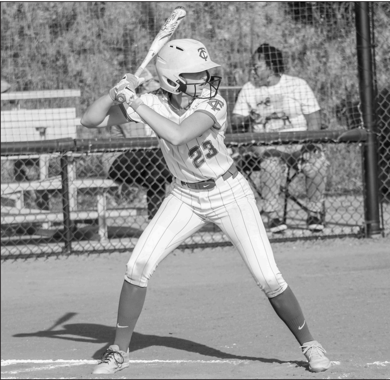
The Towns County Lady Indians are coming down the home stretch of the 2023 season.

Come out to the last scheduled race of the season on Thursday Oct. 12 which is the Tarheel 50.