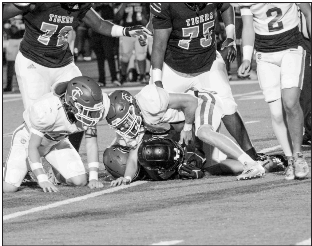
The Towns County defense drops a Tigers' ball carrier.

Defensively, the Tigers pulled off the two interceptions and one fumble recovery, adding a punt return touchdown on special teams.